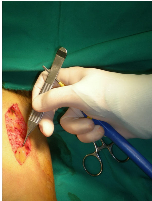
Figure 1. The cautery pencil is held upside-down in the middle of the palm; the ring finger of the same hand operates the cautery button.

We find this method for obtaining hemostasis helpful in minor surgery sessions, both in plastic surgery and dermatology settings, where budgetary restrictions may limit instrument availability or nursing staff.