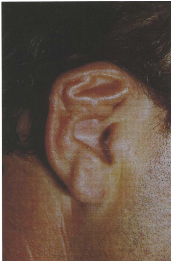
Figure 1—Cauliflower deformity of the right external ear.

Surgery was performed under local anaesthesia. A posterior approach, halfway between the sulcus and the helical rim, was used to deglove the cartilagenous skeleton. No skin ellipse was excised. Having exposed the cartilage, it was apparent that there were anterior and posterior lamellae. A plane was developed between these two structures (Fig. 2), and the posterior layer