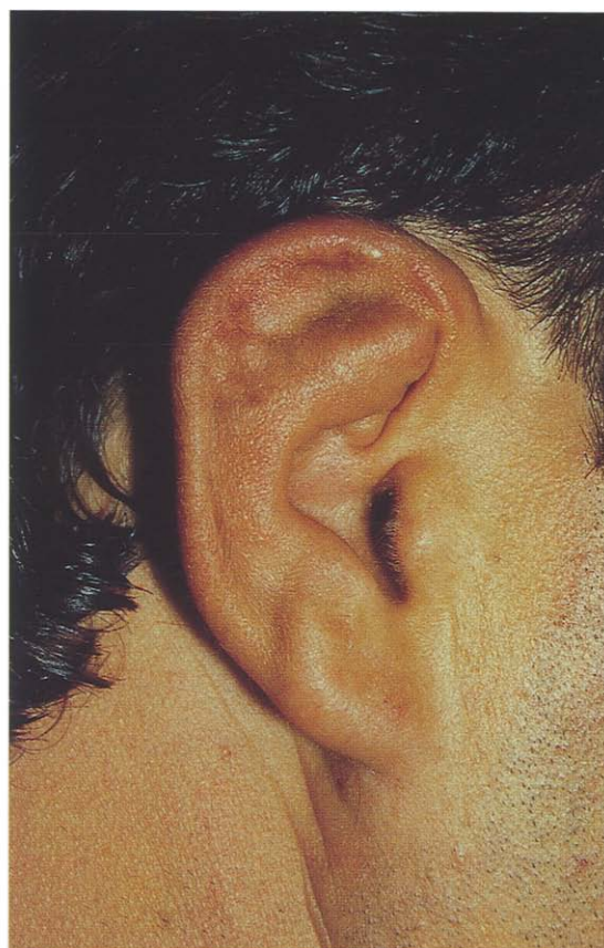
Figure 4—Final result at 10 months.

A cauliflower-ear deformity occurs when a haematoma strips perichondrium from the cartilage, resulting in the formation of a new bilaminar structure. Our patient developed a haematoma after relatively minor trauma from squeezing a 'spot'. Simple aspiration immediately after the trauma was not performed, allowing organisation of the haematoma into fibrocartilage. Studies show that after as little as 3 weeks a sub-perichondrial haematoma can result in new cartilage formation. 1 Once cartilage neoformation is established, surgical correction