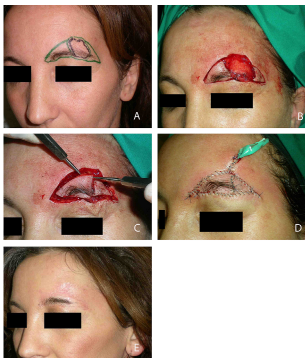
Fig. 2. A: Basal cell carcinoma of the left eyebrow and double VY flap planning. B: Skin defect after surgical excision. C: Double VY flap advanced on a random subcutaneous pedicle. D: Double VY flap closure. E: Double VY flap reconstruction at 8 months follow up.