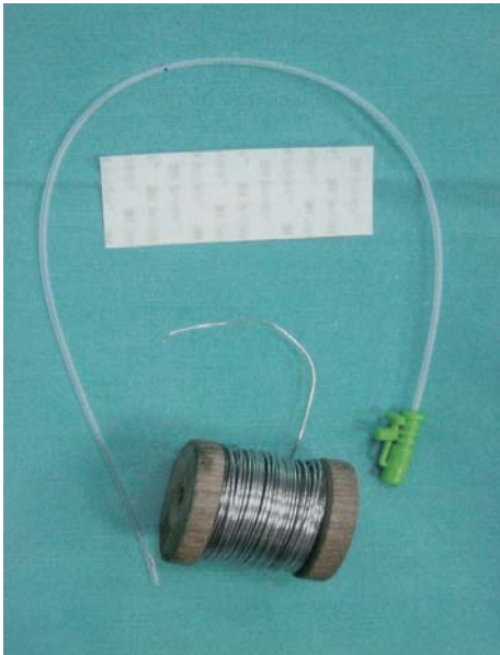
Fig. 1 Splint materials

In the last 18 months we treated 26 infants with 36 deformed ears (10 bilateral and 16 unilateral deformities): nine constricted ears, seven Stahl's ears, ten helical contour deformities and ten bat ears. The period of splint application ranged between 2 and 6 weeks. Informed parental consent was obtained in all cases. Almost all the treated ears improved significantly within the first 1 or 2 weeks after the application of the splintage. Bat ear was the most difficult deformity to treat and required a longer period of splintage than the other deformities. Our follow-up ranged between 2 and 6 months. The results were excellent in 82% of cases, satisfactory in 11% and