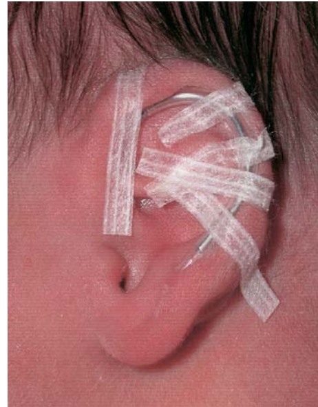
Fig. 2 Splint application